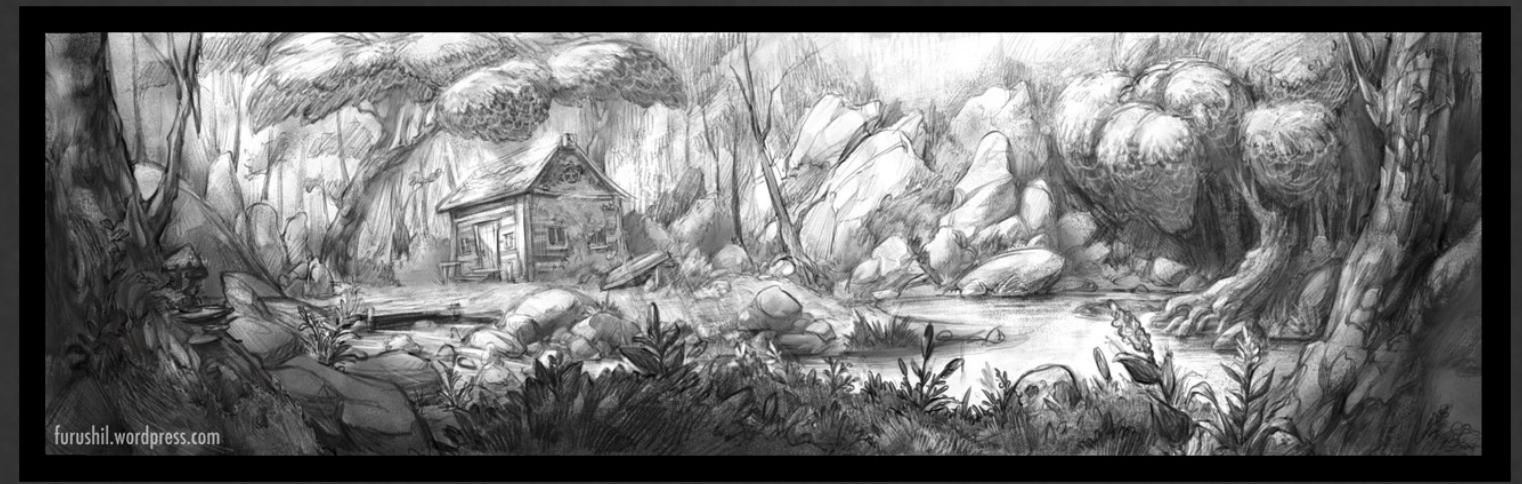
« Lake house » illustration by Paul Schwarz »