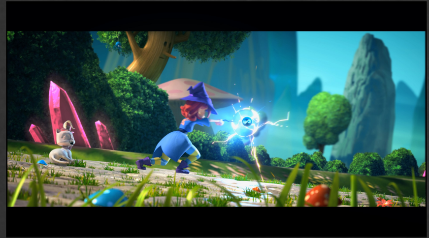
« Bubble Witch Saga 2 » animated by Nexus Productions

Animate visual effects, like thunder bolts or fire on 3D sequences; create objects libraries to animate with CelAction©; make animated characters interact within live-action sequences... Innovation opportunities are yours to pick and match.