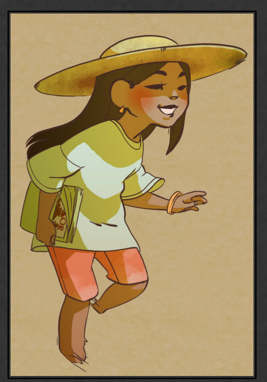
Animation by Tevy Dubray

Now stock your image references and your textures in a library made available within each project.