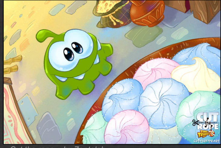
« Cut the rope » by Zeptolab

With TVPaint Animation, enjoy the possiblity to animate any style whether classical animation, manga, animated paintings, rotoscopy, cartoon... all with cartoon bravura or fine arts grace.